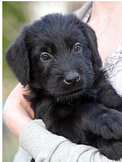
And the boys are, Piff, Puff, Pluto and Musse...